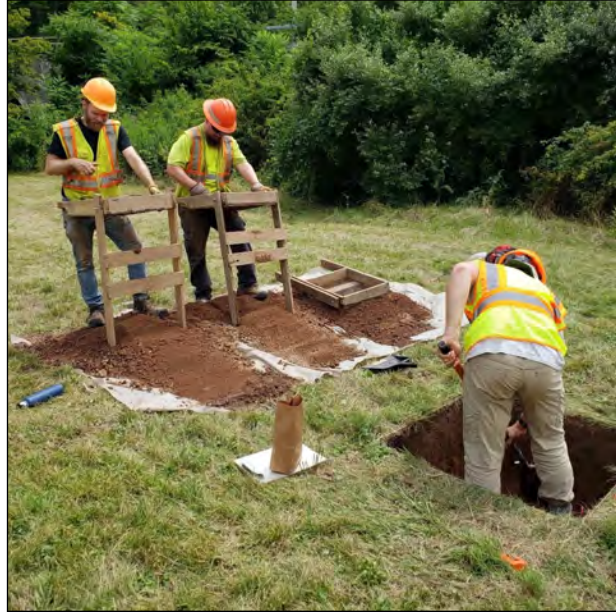
Excavations at the Kaaterskill Creek site.

Overall, the work completed at the Kaaterskill Creek site documented a temporarily occupied habitation site. Recovered cultural material include a Greene style projectile point made from local chert, chert debitage, and several hammerstones. The point suggests an occupation date from 1,200 to 2,300 years ago, consistent with the Middle Woodland period.