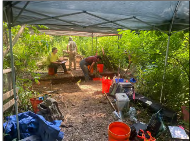
The Meadow Street site. Excavation above the proposed water line.

The Meadow Street Precontact site Phase 3 Data Recovery Project fieldwork was conducted in the Village of Otego, Otsego County. The fieldwork became quite exciting when the infamous July 16, 2024 storm flew in like the Wicked Witch of the West. We left the site early that day, and just in the nick of time: Twenty minutes later, the wind became strong enough to knock trees onto our shelters.