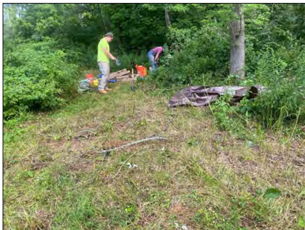
Meadow Street Site: Looking up from Terrace 1 to Terrace 2.

Based on the terrace sequence nearby that was worked-out and radiocarbon-dated by Funk and colleagues, T2 formed ca. 4000-1 BC, and T1 formed after ca. 1 BC. The usual stratigraphic sequence was an A-B horizon sequence, although in places an A-A-B sequence occurred. At the aforementioned deeper stratigraphy, the sequence was A-B-A-B, with the lower A preserving the degree and orientation of the slope before T1 stabilized. The earliest cultural material item found at the site was a fragment of a Rossville point in the lower A of an A-A-B sequence. The age estimate of this point type is ca. 500 BC-100 AD. Most of cultural materials were found in the upper stratigraphy, including either the undifferentiated A horizon or in the upper A. This component appears to date to about AD 800-1100 (Late Middle-Early Late Woodland) based on the recovery of several Levanna points and a Jack's Reef Pentagonal point. No pottery was found. The main lithic source appears to be glacially deposited Onondaga chert pebbles collected locally, although small amounts of Esopus chert and Pennsylvania jasper were also found. The lithic assemblage is currently being studied, and the report is scheduled for completion this summer.