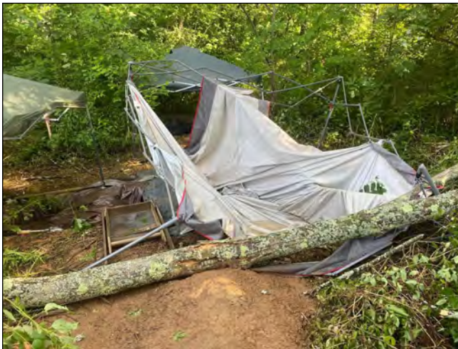
July 2024 storm damage at the Meadow Street site.

The area we investigated was the small part of the site where a new water well will be drilled and a connecting line will provide the well water to an existing distribution system. The Meadow Street site is located on alluvial terraces of the Susquehanna River, just below a glacial outwash terrace. The geomorphic context is similar to that of the Kuhr No. 1 and No. 2 sites on the Otego floodplain excavated by former New York State Archaeologist Robert E. Funk. The terrace sequence (T0 through T3) and the associated, approximate ages of terrace formation have been reconstructed based upon Funk's work with geomorphologists Robert Dineen, James Kirkland, and P. Jay Fleisher. The Meadow Street site occupation area is on T2 and, to a limited extent, onto T1. There was some limited vertical stratification of these de-