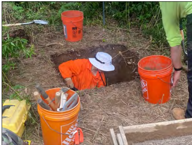
Meadow Street Site, Unit 9, deep digging on the outer edge of Terrace 2.