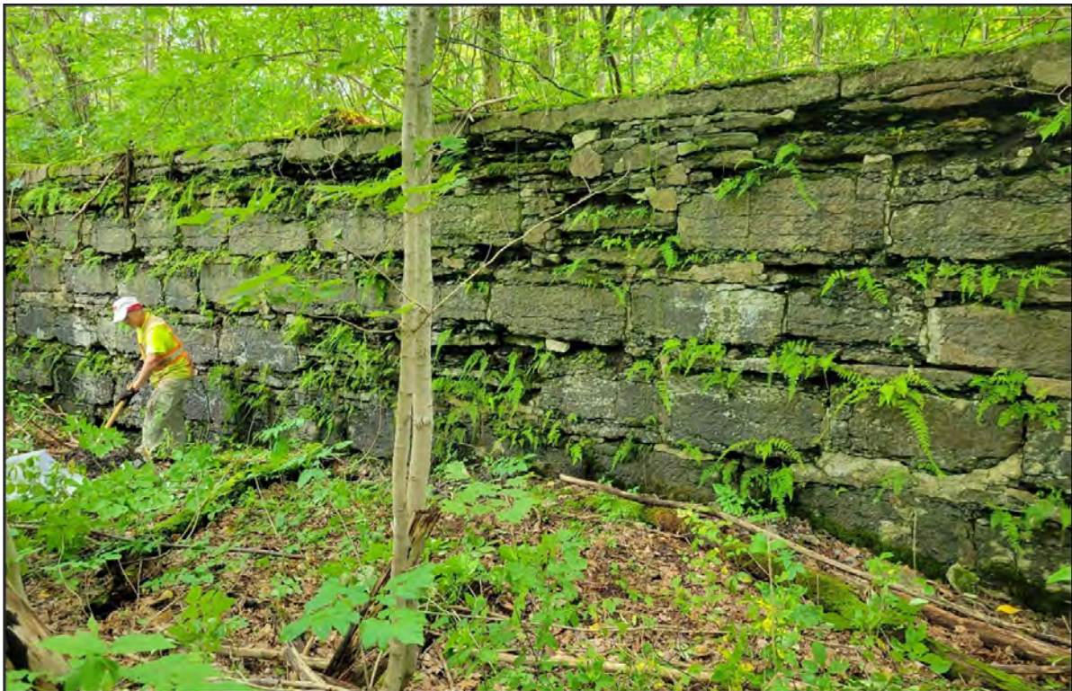
STP inside Lock 36.

Operational between 1851-1924, the Black River Canal opened previously inaccessible portions of New York State to widespread markets via a lateral connection with the Erie Canal. Further, the Black River Canal Lock #36 Site contributes to our understanding of mid-nineteenth century transportation engineering.